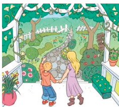
The Well-Kept Secret

According to the cover, "The story makes readers travel between the reality and fantasy worlds of children. It makes readers believe in the pure trust, harmony, and love that only